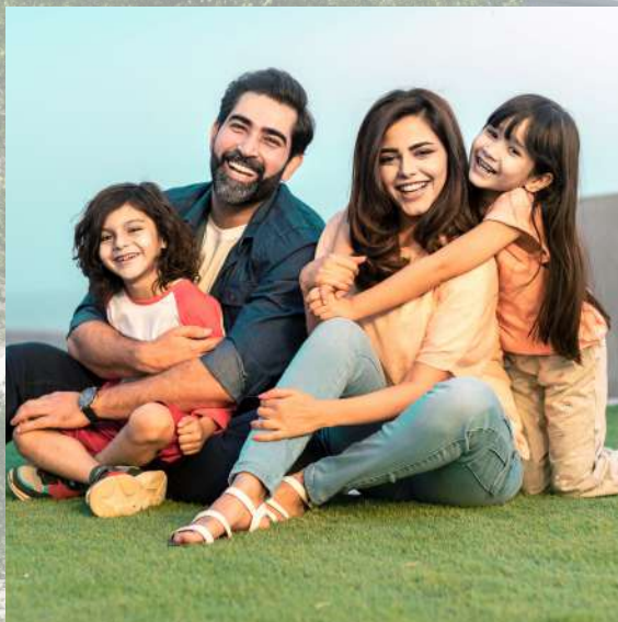
Secure & Gated Community