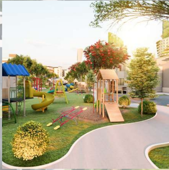
Lush Green Central Park