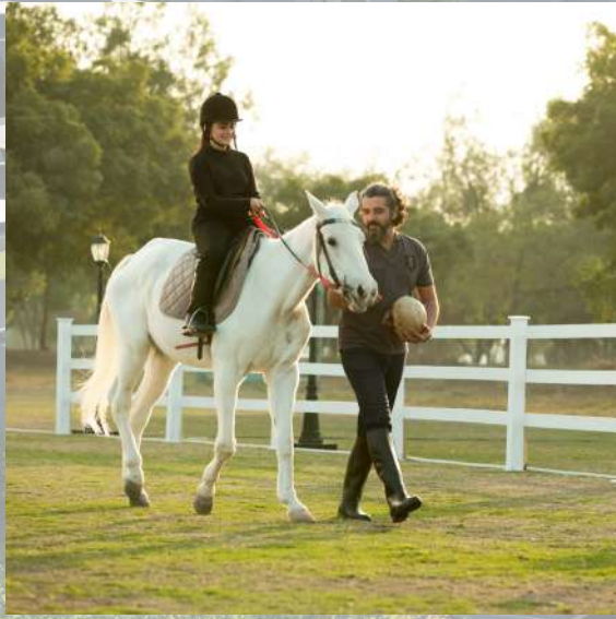
Horse Riding & Archery Club